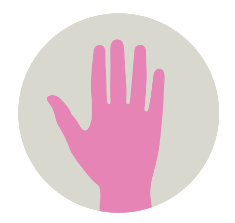
1. Put one of your hands out so you're looking at your palm.