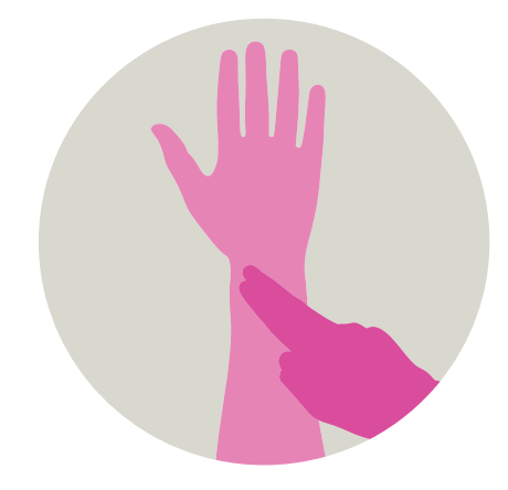
2. Use the index finger and middle finger of your other hand and place the skin of these fingertips on the inside of your wrist. You should place them at the base of your thumb near where the strap of a watch would sit.