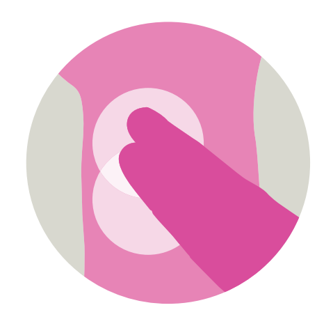
3. Press lightly and feel the pulse. If you can't feel anything press slightly harder or move your fingers around until you feel your pulse.